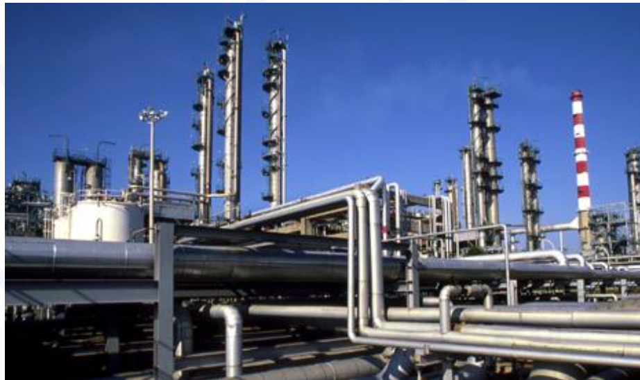
Utility Piping (SS/MS/GI/PVC/HDPE/PPRC)