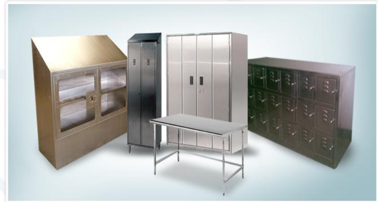
Clean Room Furniture (SS 304,316,316L)