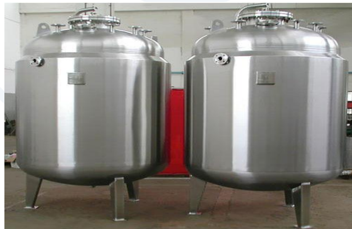
SS 316 Storage Tank