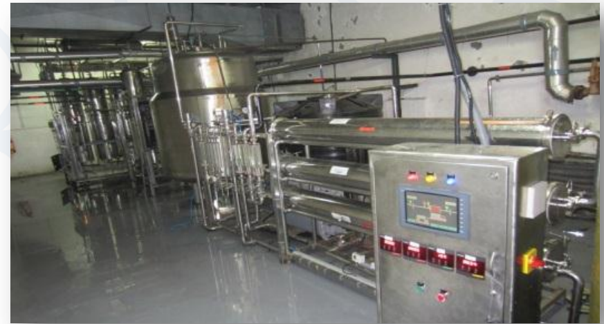
Actual Site Image at Gujarat