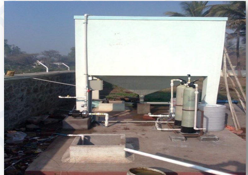
Actual Site Image at Miraj