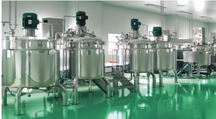
Homogenizer SS 316L