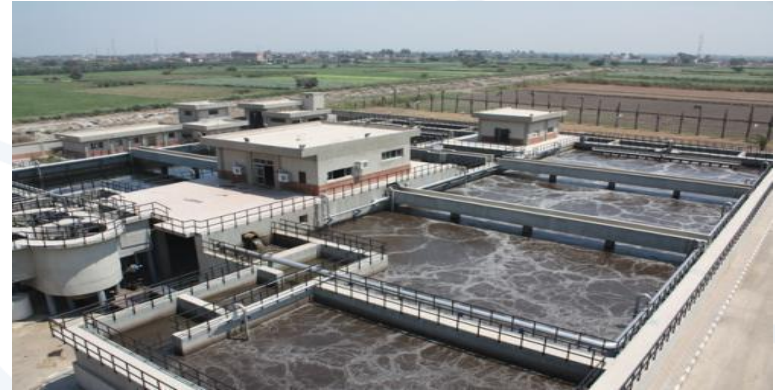
Waste Water Treatment [ETP/STP (1KLD-50KLD)]